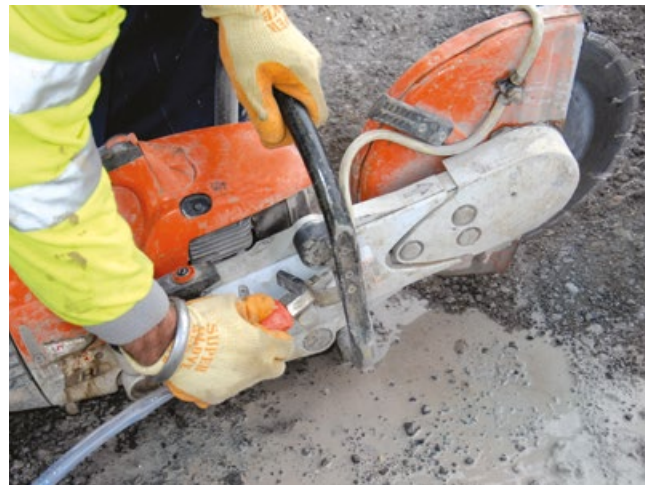
Figure 3 Water suppression on a cut-off saw