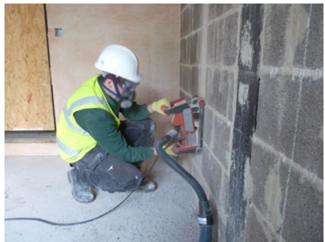
Figure 4 Wall chasing using on-tool extraction